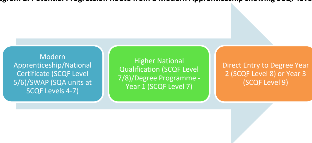
Diagram 1: Potential Progression Route from a Modern Apprenticeship showing SCQF levels

Careers IAG (CIAG) that is available and offered in schools should be linked to articulation opportunities and routes. Currently, the main source of CIAG in Scottish Secondary schools is provided by Skills Development Scotland (SDS) 18 through Careers Advisors and My World of Work 19 , and aligns with the recommendations from the Commission on Developing Scotland’s Young Workforce (DYW) 20 . Therefore, SDS is well placed to raise awareness of articulation and promote it to pupils across the country.