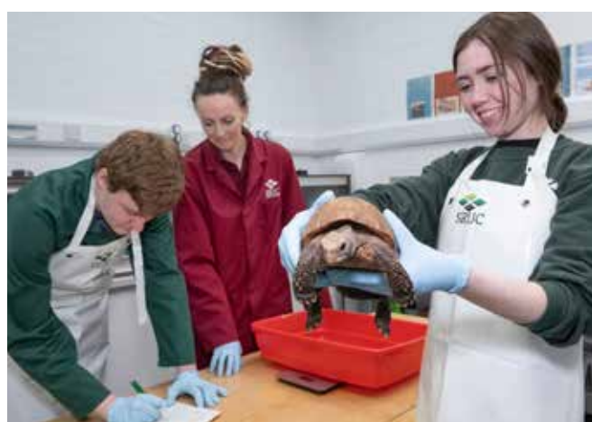
Animal Care, SRUC

To deal with the immediate deficit and to prevent colleges from becoming technically insolvent, there is a critical requirement for the Scottish Government to deliver a restoration of funding to the college sector, to match the level of funding received by the sector in 2021/22, which has declined year on year since. This will total £100.5m, as the funding in 2021/22 was £732.8m and the funding for 2023/24 was £675.7m (as set out in Graphic 1).