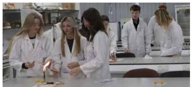
Science, West Lothian College

For sector funding to be fully maximised, and ensure the five-year plan is delivered, there is a need for the Scottish