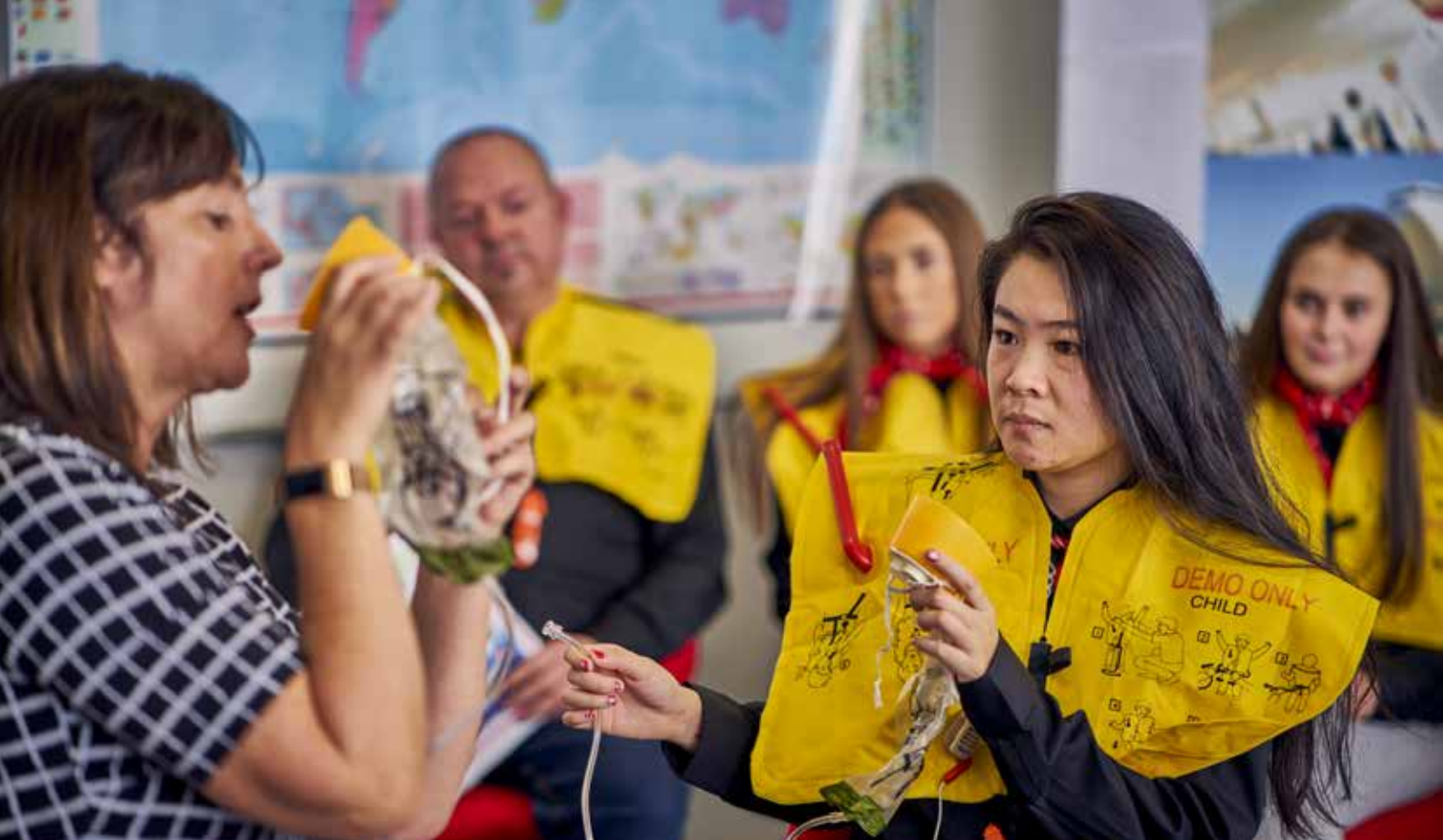
Travel and Tourism, West College Scotland

Fair Work and Business – Colleges work closely with business to support innovation and growth, whilst enabling learners to gain the skills with which to move into quality jobs. Enhanced and increased partnerships with industry, Innovation Centres, schools and community stakeholders, are all critical parts of the work of colleges.