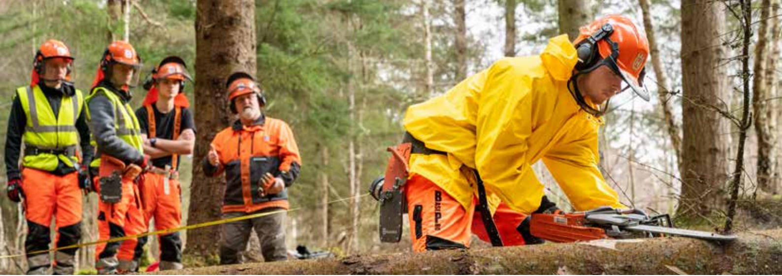
School of Forestry, UHI Inverness