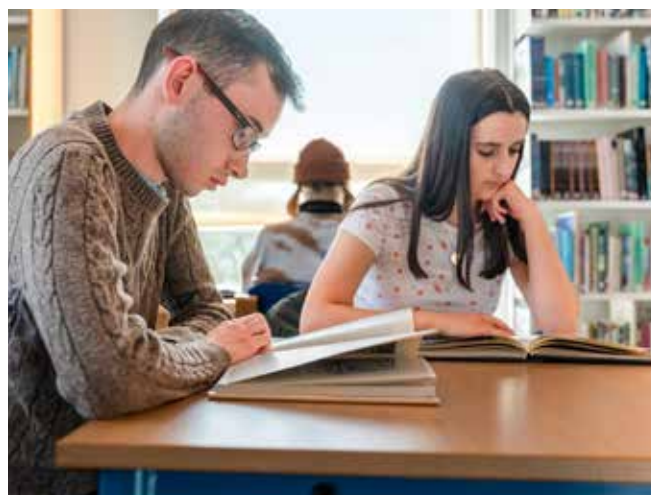
Students in Library, Sabhal Mòr Ostaig