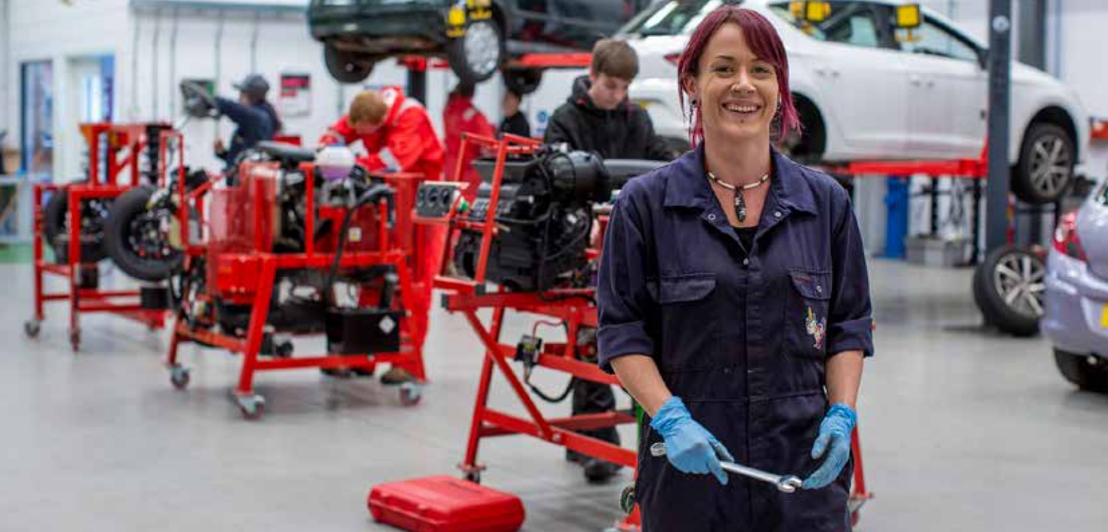
Automotive, North East Scotland College