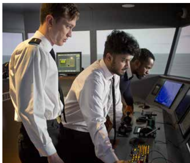
Nautical Studies, City of Glasgow College

Poverty – Colleges offer educational and vocational opportunities to people from some of the poorest communities in Scotland, proactively working with schools to address the school attainment gap – that is, the difference in achievement between Scotland's poorest and richest young people.