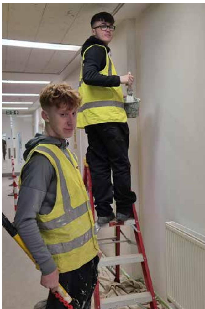
Painting and Decorating, Dumfries & Galloway College