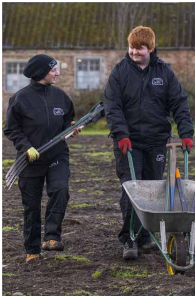
Rural Skills, Newbattle Abbey College

In addition, support from Scottish Government is essential for the continued delivery, and sustainability, of collective National Bargaining in the college sector. Continuing industrial action over a number of years has significantly impacted the learning and teaching of students and has been caused in the main by disputes over pay.