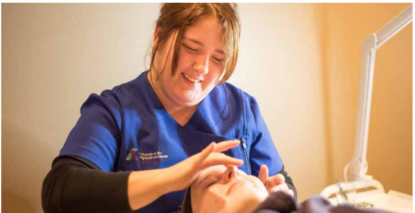
Beauty Therapy, UHI Argyll