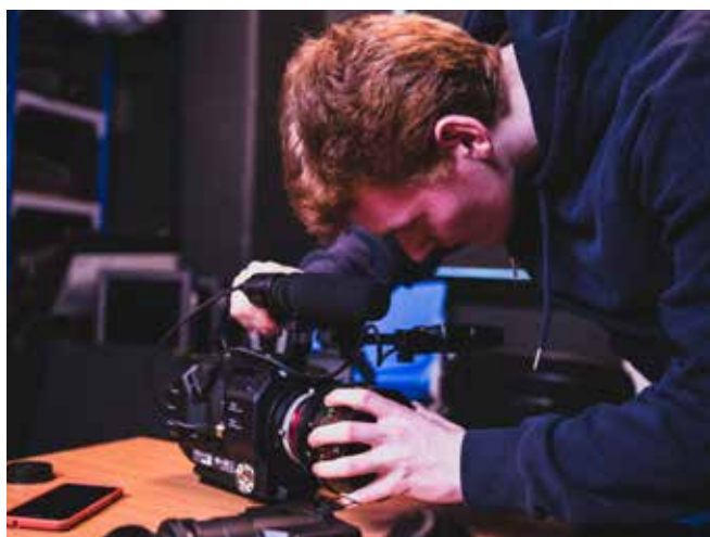
Digital Film and Television, Glasgow Clyde College

In 2022/23, 496 staff left colleges through voluntary severance, with 231 members of staff leaving through voluntary severance in 2021/22.