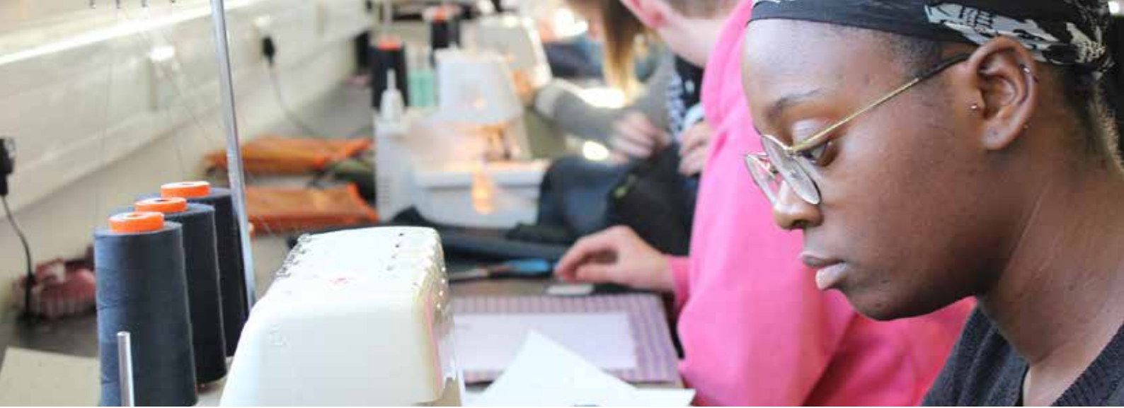
Art and Design, Dundee and Angus College

Graphic 1 evidences the funding levels received by colleges in cash-terms for each Academic Year (AY) since 2016/17. Whilst funding levels increased until 2021/22, the following points should be noted: