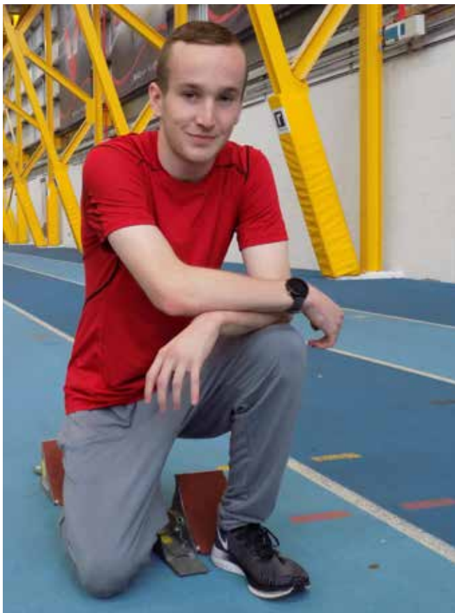
Disability Sports, New College Lanarkshire

This position echoes the recommendation given by the Education, Children and Young People Committee in their College Regionalisation Inquiry report published in March 2023: “The Committee recommends that the Scottish Government and Scottish Funding Council urgently give colleges as many financial and operational flexibilities as possible to help them deliver on the various strands of their work. This could include, but not be limited to: flexibility for year end, flexibility on SFC outcomes and flexibility in terms of access to additional funds”.