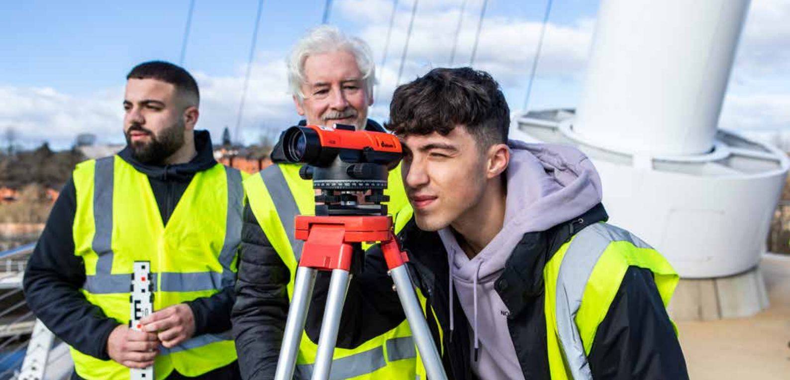
Civil Engineering, Glasgow Kelvin College