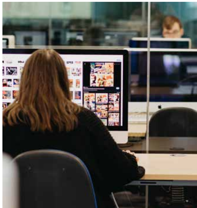
Digital, Fife College

The college sector is working with the SFC to deliver an Infrastructure Investment Plan, following the publication of the College Infrastructure Strategy in November 2022. We are now seeking the full support of the Scottish Government to explore how the requisite resource can be provided to remedy the outstanding maintenance issues and subsequently place colleges on the path to Net-Zero, through a plan for a national renewal of college estates as per the recommendations outlined by the Education, Children and Young People Committee. This will complement the activity being progressed by the SFC to establish the infrastructure baseline for the college sector.