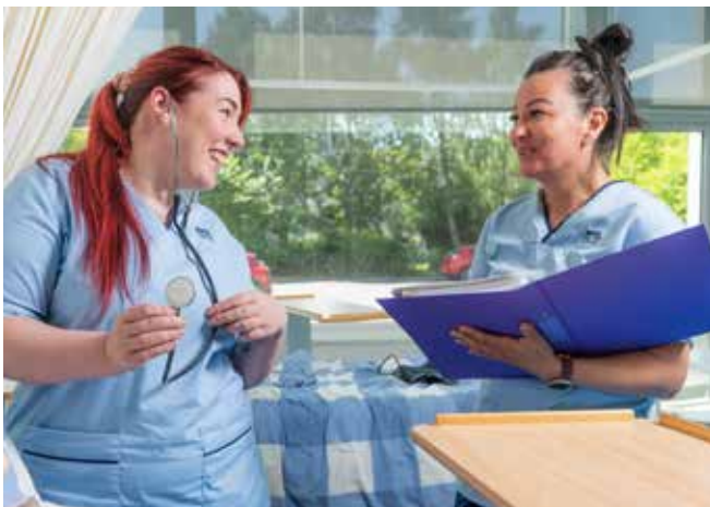
Healthcare Practice, Forth Valley College

As civic anchors, all 24 colleges in Scotland play a vital role in the social and community make up of 'our places' i.e. the combined physical, social and cultural environment. Colleges help the most disadvantaged and furthest from the labour market, and power regional economies by delivering the skilled workforce and innovative practice needed by business and industry, giving opportunities for all.