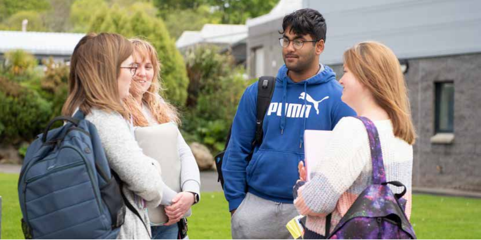
Students, UHI North, West and Hebrides